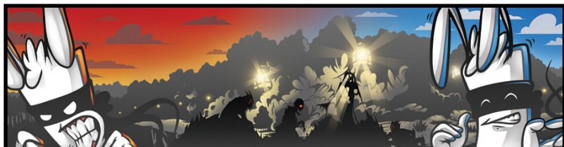
© Piotr Pest Piglas, https://www.behance.net/Pest —Untitled. Use herein per Creative Commons license (CC BY-NC 4.0). No substantive modifications made from source material; resized to fit.

Nominees for the 43 rd Annual Annie Awards (for “the year’s best in the field of animation”) have been announced by the International Animated Film Society/ASIFA-Hollywood < www.asifa-hollywood.org >. The list is extremely long—it would run around 4 pages in the Shuttle —and not completely focused on genre animation, so check the award website at < annieawards.org/nominees > to see the full list.