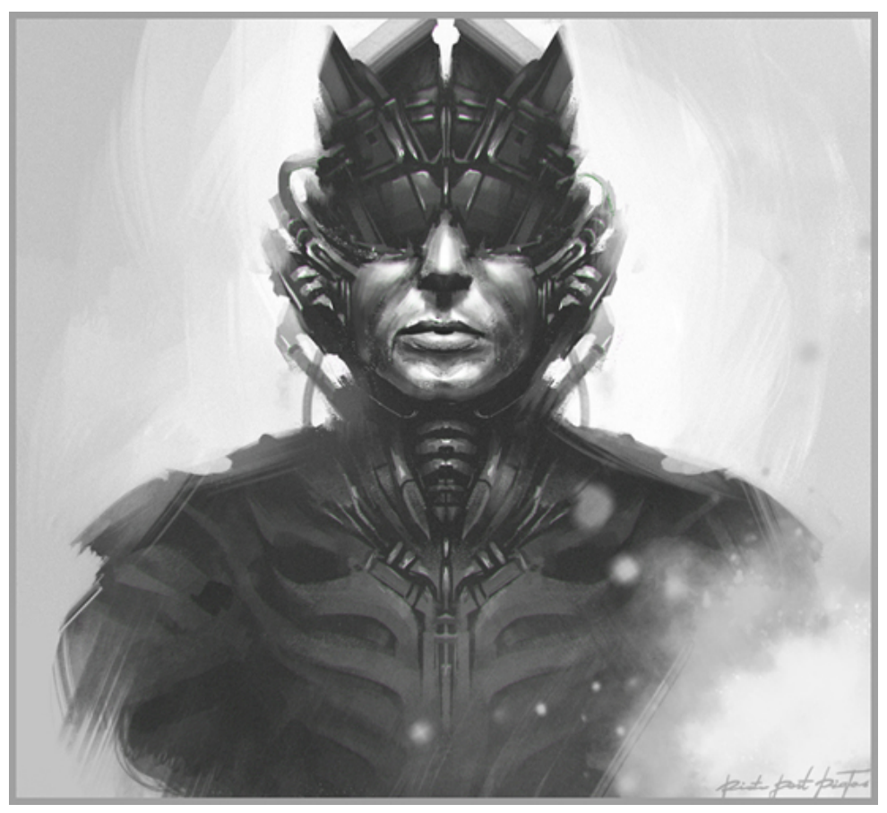
© Piotr Pest Pigłas, https://www.behance.net/Pest—Untitled Concept Drawings. Use herein per Creative Commons license (CC BY-NC 4.0). No substantive modifications made from source material; resized to fit.